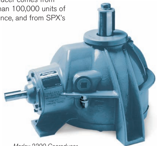
Marley 2200 Geareducer

attention to exacting quality standards of design and manufacturing. Today, every Geareducer is tested under load at our factory. Then, it's inspected and adjusted before shipment. This has resulted in an unequalled history of trouble-free operation.